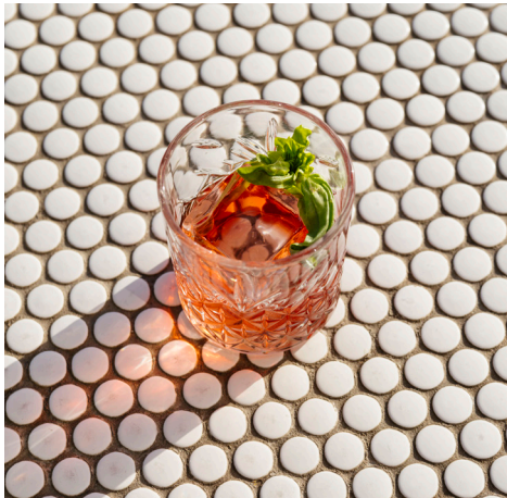
Drinks are subject to menu changes and availabilty